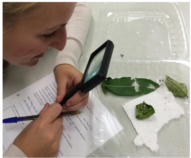
Example of clear container, caterpillars on milkweed, student using observation sheet.