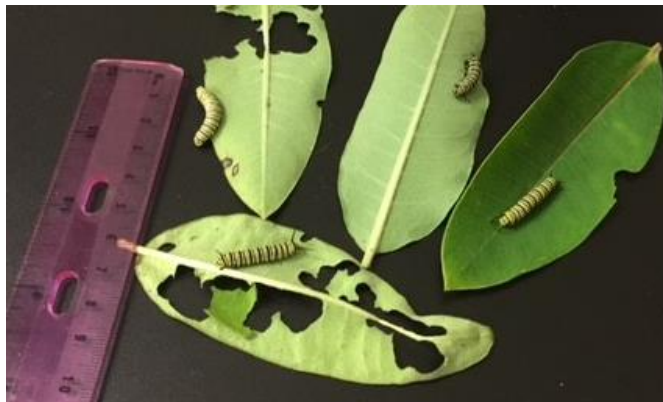
A local supply of milkweed must be available to feed the caterpillars. Learning about the milkweed food source is an important part of the study.